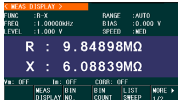
High Resolution Measurement Screen