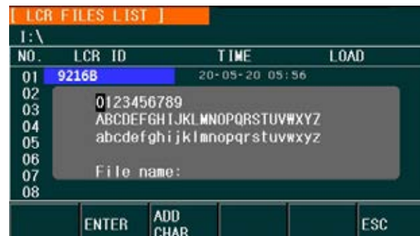
Ddat Storage Screen